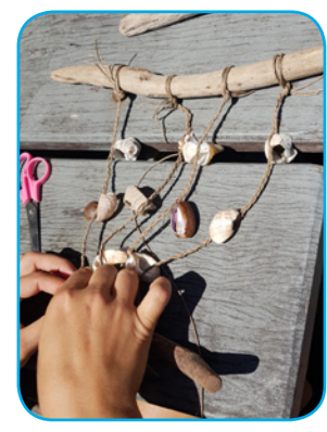
Shell hanging by Wulaaran