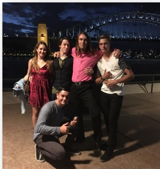
Ready for the theatre!