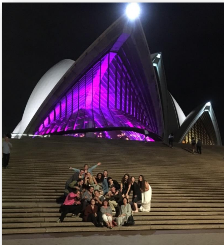
At the Opera House