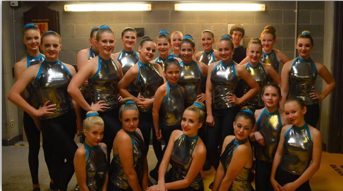
MHS Dance Ensemble