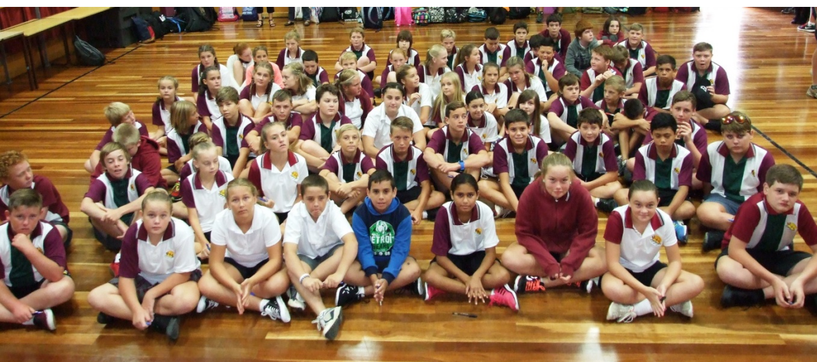
Pic above and left:

Year 7 enjoying their first day at High School.