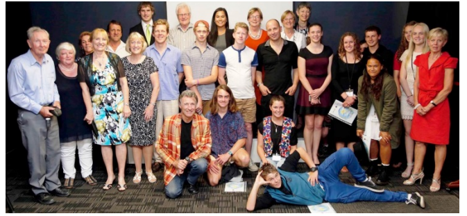
RyMarine dinner – October 10 – members of the Coffs Harbour Rotary Club plus students after their Presentation.

I was selected to attend RyMarine at Coffs Harbour in October. My place was partially sponsored by Macksville Rotary Club with a generous contribution of 250 dollars towards my camp costs. At the camp I was joined by 13 other students from other schools including Port Macquarie, Coffs Harbour, Tamworth, Grafton, Armidale and Walcha.