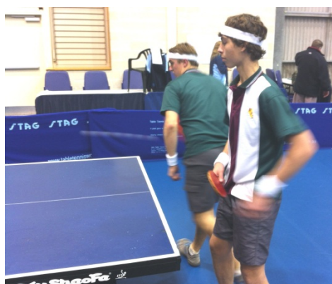
TABLE TENNIS CHAMPIONS

The team from MHS finished a creditable 7 th in the State Knockout competition.