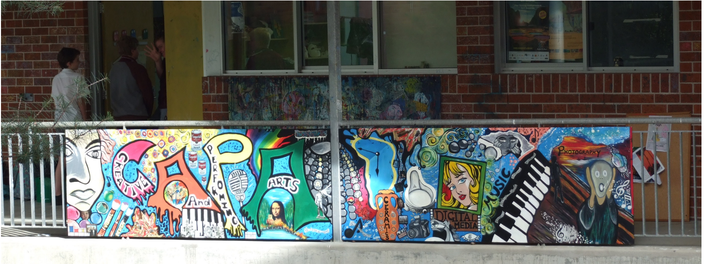
Photo: of CAPA Mural & of Mural outside Art 2

Both the students and teachers in Visual Arts have been working tirelessly to create colourful and challenging artworks that brighten up not only the Art Block but also the whole school.