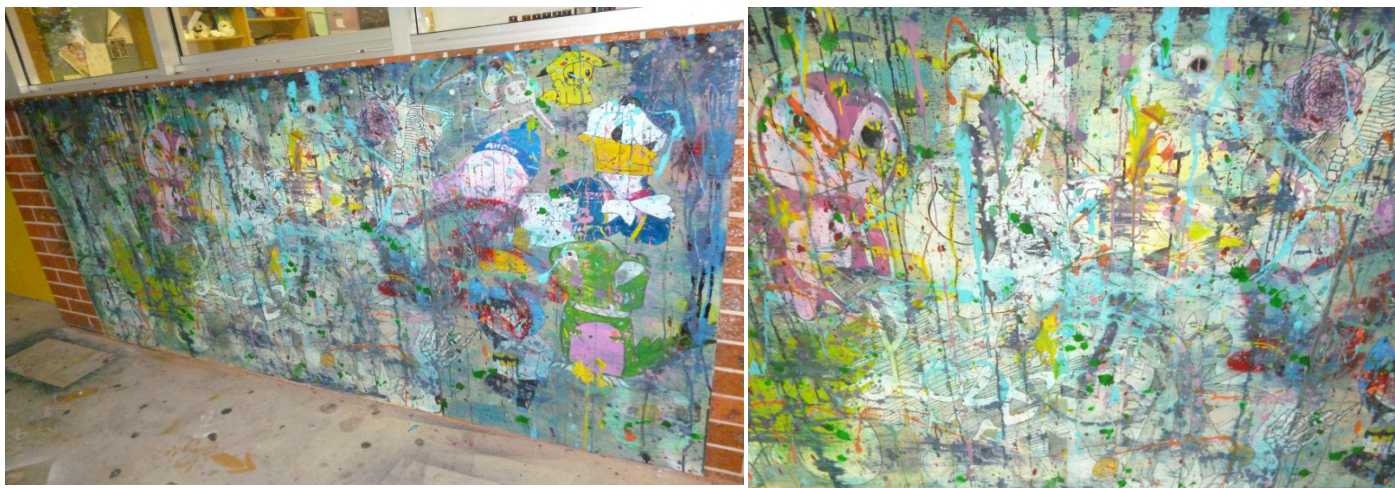
Above: Mural outside Art 1