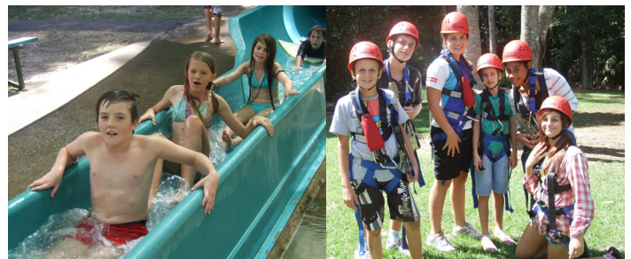
2012 Year 7 Excursion - Yarrahappinni Youth Centre