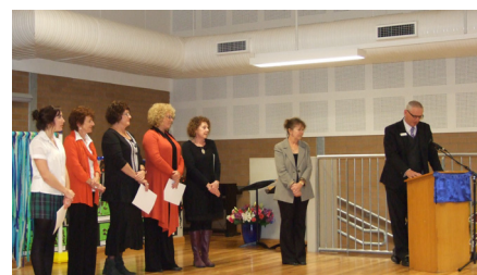
2011 Education Week Awards Ceremony