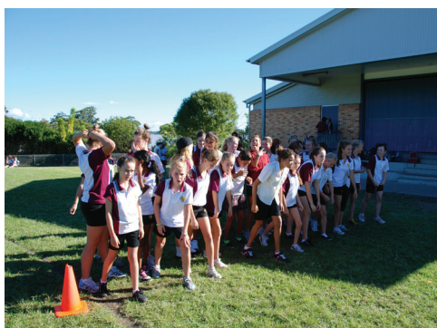
The start of the 13yr girl’s race at MHS. The 13yr girls’ team were also Zone Champions at Kendall.

On Wednesday 19 May, 45 Macksville High School students attended the Zone Cross country carnival. The event was held on and around the Kendall Showground and still includes the legendary long, steep hill that is remembered by all who have climbed it. Macksville finished in second place behind a very strong Wauchope team. 27 students have been selected on the zone team to compete at Nana Glen Equestrian Centre on June 10, they are: