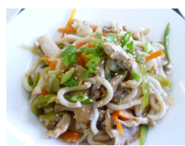
Stirfry chicken & noodles