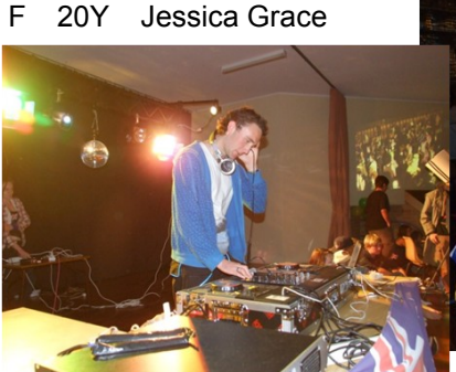
Fun at the Aussie Disco