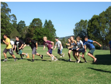
Above left: A great time had by students with teachers even getting a little fitness

The winning house was Oxley with 355 points closely followed by Graham on 349 then Briner at 330 and Taylor on 280.