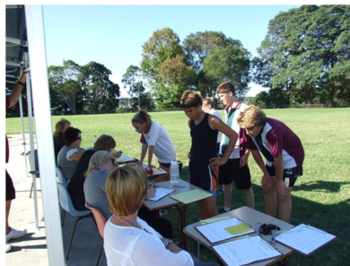
Above right: Our hard working Marshalls making sure all the results were tallied on the day.