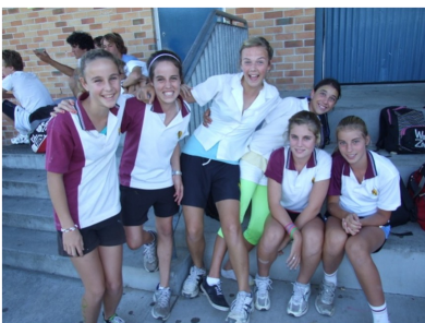
At left: Having fun and ready to race