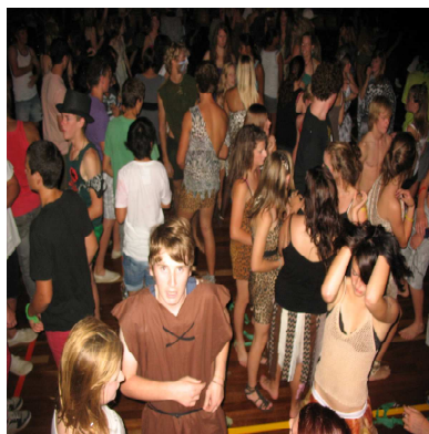
Below: students dancing