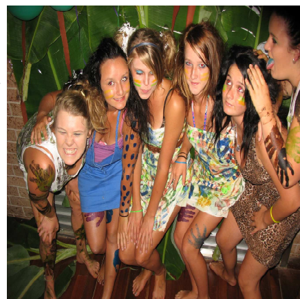
Above: Jungle critters from various years