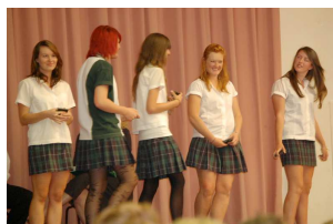
Students receiving Principal's Award

A very successful Yr12 Farewell Assembly was held in the Stadium on Thursday October 1.